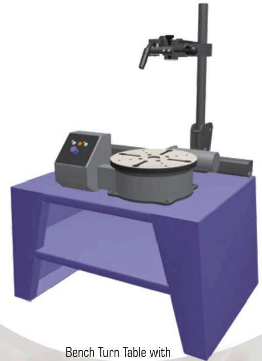
Bench Turn Table with torch mounting carriage and manual torch lift