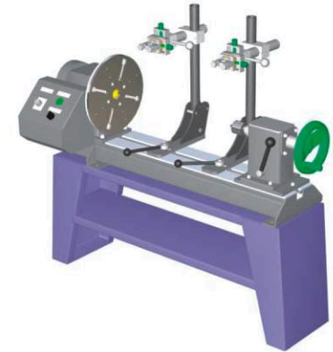
Torch mounting carriage - with manual torch lift