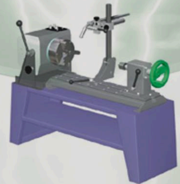
Self centering 3 jaw chuck